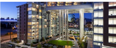
1553-1577 MAIN STREET, VANCOUVER BC