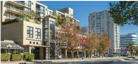
CAPRI 7831 WESTMINSTER HIGHWAY RICHMOND, BC