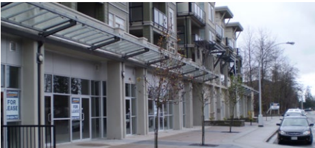
CHARLTON PARK SURREY, BC