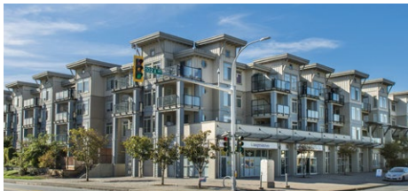
CHARLTON PARK C 10180 153RD STREET SURREY, BC