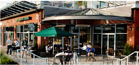
THE BRUNSWICK RICHMOND, BC