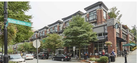
SUTER BROOK VILLAGE PORT MOODY, BC