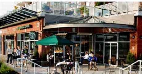
THE BRUNSWICK RICHMOND, BC