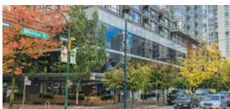
SEYMOUR 1022 SEYMOUR STREET VANCOUVER, BC