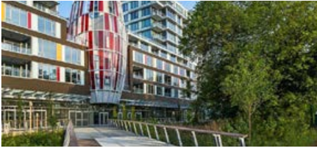
ORA 6951 ELMBRIDGE RICHMOND, BC