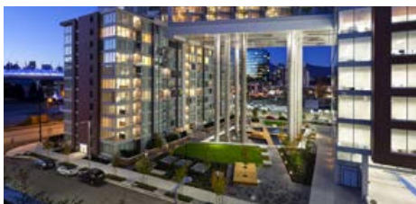
1553-1577 MAIN STREET, VANCOUVER BC