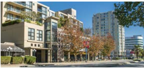
CAPRI 7831 WESTMINSTER HIGHWAY RICHMOND, BC