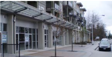
CHARLTON PARK SURREY, BC