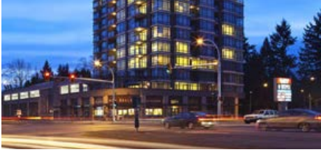
THE SHAUGHNESSY 2789 SHAUGHNESSY STREET PORT COQUITLAM, BC