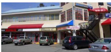
3355 NORTH ROAD BURNABY, BC