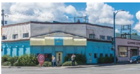
1298 HASTINGS, VANCOUVER BC