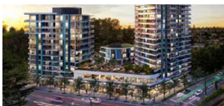
NORTHWEST 8199 CAMBIE STREET VANCOUVER, BC