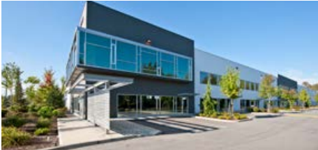
27353 58TH CRESCENT LANGLEY, BC