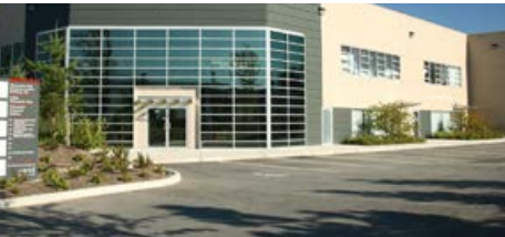
27090 GLOUCESTER WAY LANGLEY, BC