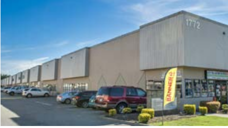
1772 BROADWAY STREET, PORT COQUITLAM, BC