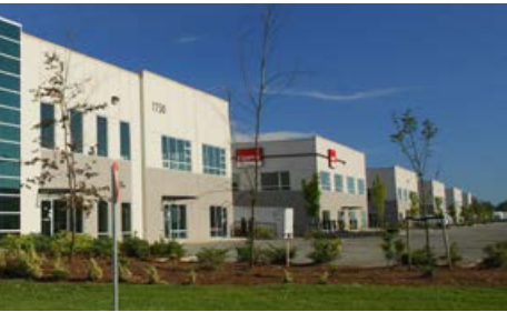
1750 COAST MERIDIAN, PORT COQUITLAM, BC