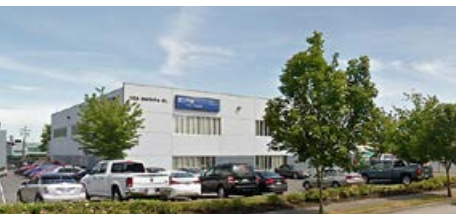
1128 BURDETTE STREET RICHMOND, BC