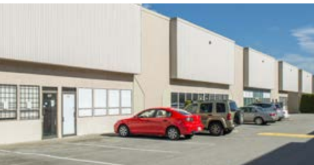
1776 BROADWAY STREET, PORT COQUITLAM, BC