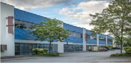
81 GOLDEN DRIVE COQUITLAM, BC