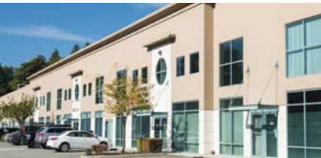
1533 BROADWAY STREET PORT COQUITLAM, BC