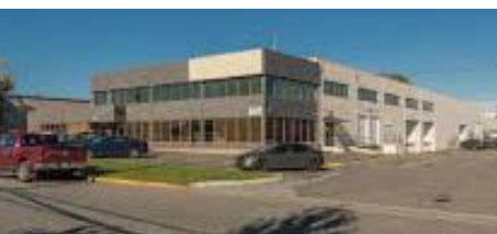
14251 BURROWS ROAD RICHMOND, BC