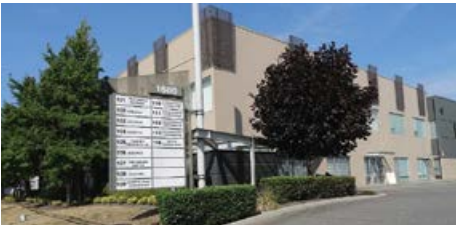
1680 BROADWAY STREET PORT COQUITLAM, BC