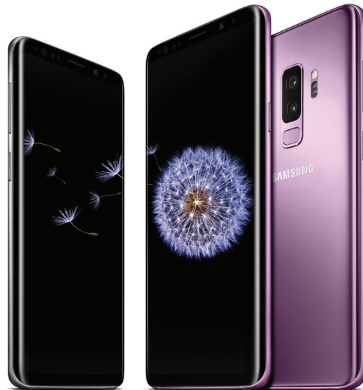
SAMSUNG Galaxy S9 | S9+

Get $200 off select smartphones when you sign up for mobility for 2 years, and add it to your TELUS home services. 1, 2