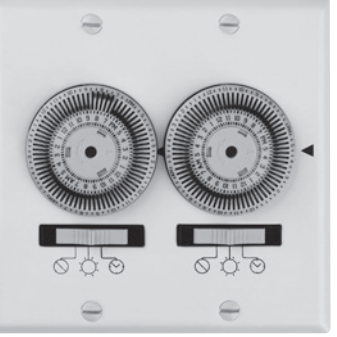
Dual Timer (2-gang with 2 KM2's)

24 Hour 7 Dav Model Code Model Code Switch Description KM2 ST-1G KM2 SW-1G 20A, SPST single gang KM2 STu-1G KM2 SWu-1G three-way single gang 20A, SPDT KM2 ST-2G KM2 SW-2G 20A, SPST 2-gang/toggle opening KM2 ST-2R N/A 2-gang/receptacle opening 20A, SPST KM2 ST-2D KM2 SW-2D 20A, SPST 2-gang/decorator opening KM2 ST-3D N/A 20A, SPST 3-gang/decorator opening 20A, SPST KM2 ST-3G N/A 3-gang/toggle openings KM2 ST-4G N/A 4-gang/toggle openings 20A, SPST KM2 STST-2G KM2 SWSW-2G 2-gang/dual timer (2) 20A, SPST