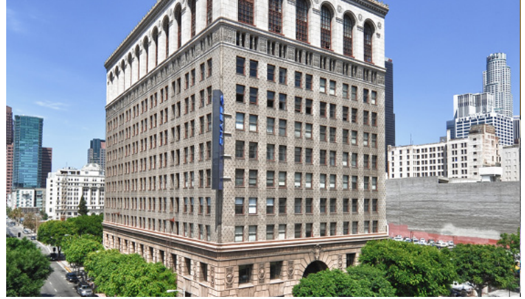
LOS ANGELES, CA - THE COAST SAVINGS BUILDING 315 W 9TH STREET

CHRIS SINFIELD, TOM SHEETS, QUINT CARROLL CUSHMAN & WAKEFIELD 310.525.1922