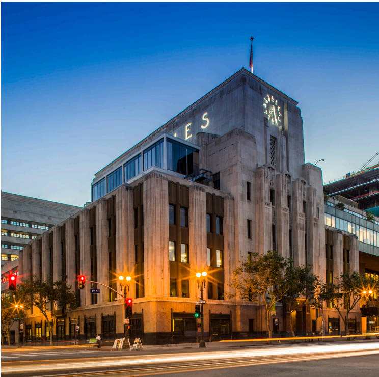
LOS ANGELES, CA - THE LOS ANGELES TIMES CAMPUS 202 W. 1ST STREET