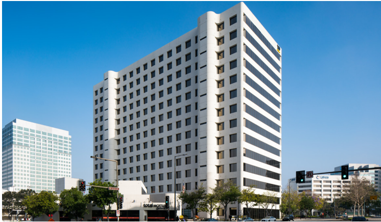
GLENDALE, CA 611 N. BRAND STREET