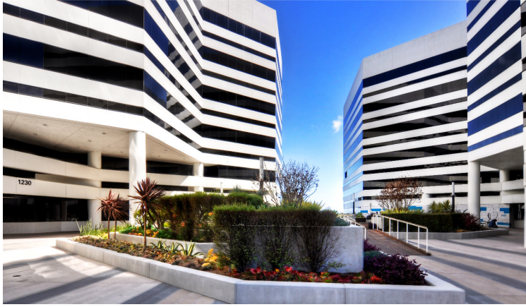
MANHATTEN BEACH, CA - MANHATTEN BEACH TOWERS 1230 ROSECRANS AVENUE