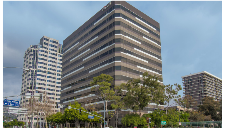
GLENDALE, CA 700 N. BRAND STREET