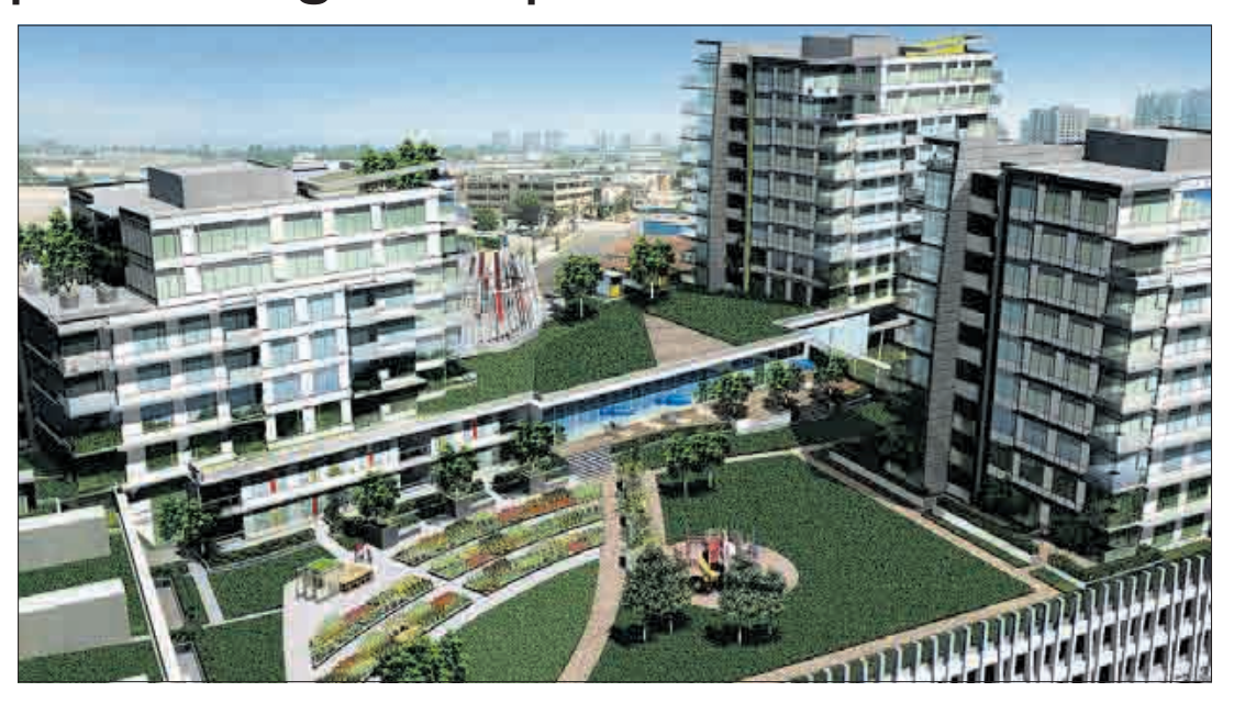
Onni Group's Ora development will feature a landscaped rooftop courtyard and garden plots.

"The majority of the homes in all three phases will have square feet and in the lower levcity, water and mountain els of the towers, would be ideally